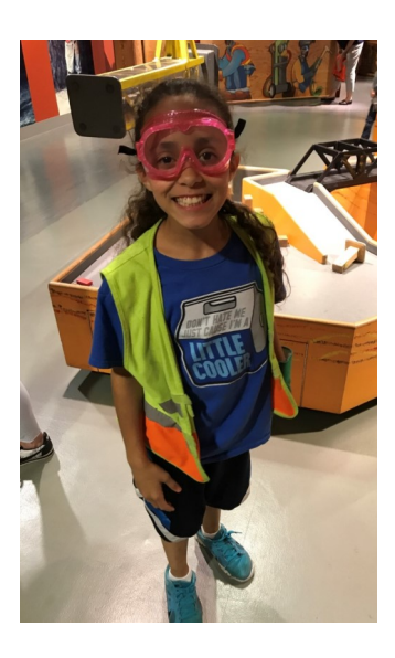
79% of our Club members expect to attend college.