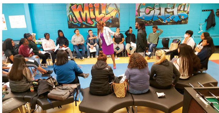
Teens participating in a Gender Issues workshop in the newly expanded Teen Lounge