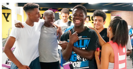
Club teens were thrilled when they saw the Planet Fitness mini judgement free zone for the first time