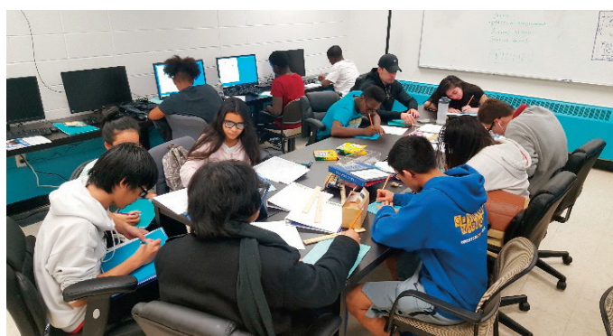
Teens in the new Career & College Readiness Center prepare their portfolios

1 "America after 3 PM , Afterschool in Communities of Concentrated poverty", Afterschool Alliance, 2016.