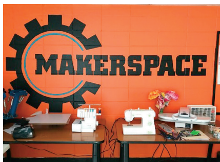
Teens made their mark in the new Makerspace by designing and painting this graphic on the wall.