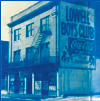
Honor the past