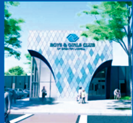
Look towards the future

FOLLOW US ON SOCIAL MEDIA! 657 MIDDLESEX STREET, LOWELL, MA 01851 • TEL: 978-458-4526 • WWW.LBGC.ORG