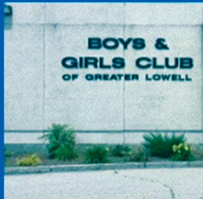
Celebrate the present